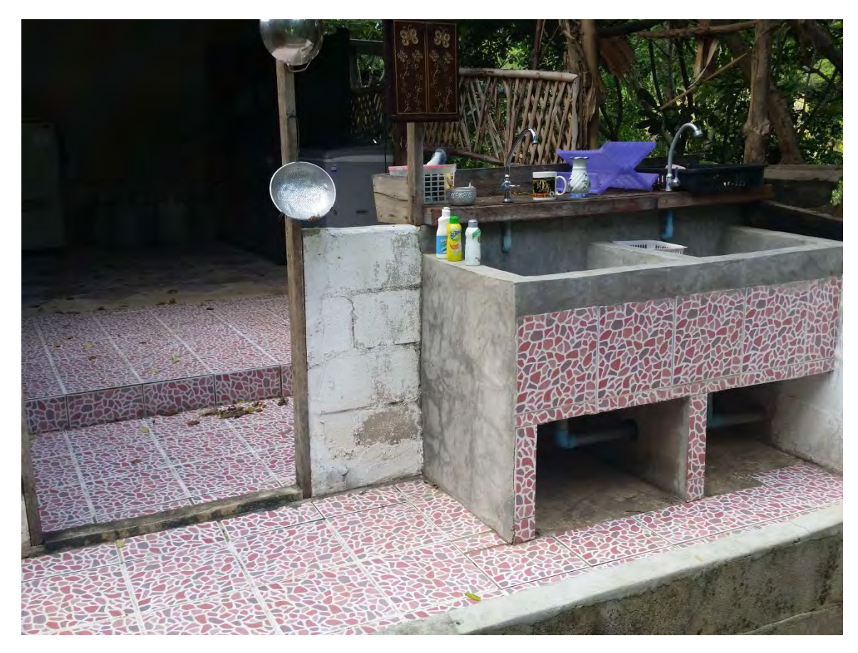
Kitchen / Sinks Condition – {Floor / Knee Wall / Sink} Ok / No Roof

Recommendation – Replace {Plumbing / Taps / Shelves / Wiring / Fixtures / Thatch / Roof}