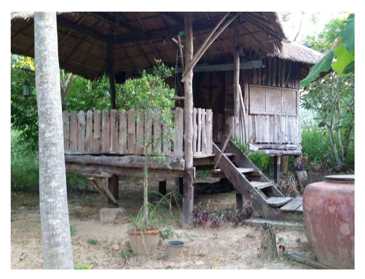
Gandah Condition – Good / Unknown

Recommendation – New Thatch Unknown - Replace {Wiring / Fixtures}