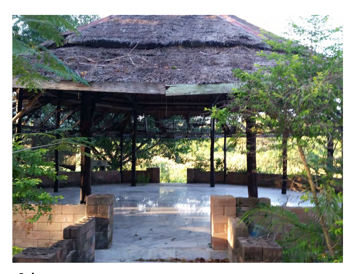
Sala Condition – {Floor / Knee Wall} Ok / ½ Roof Recommendation – New Thatch / New Shrine / Replace {Wiring / Fixtures}