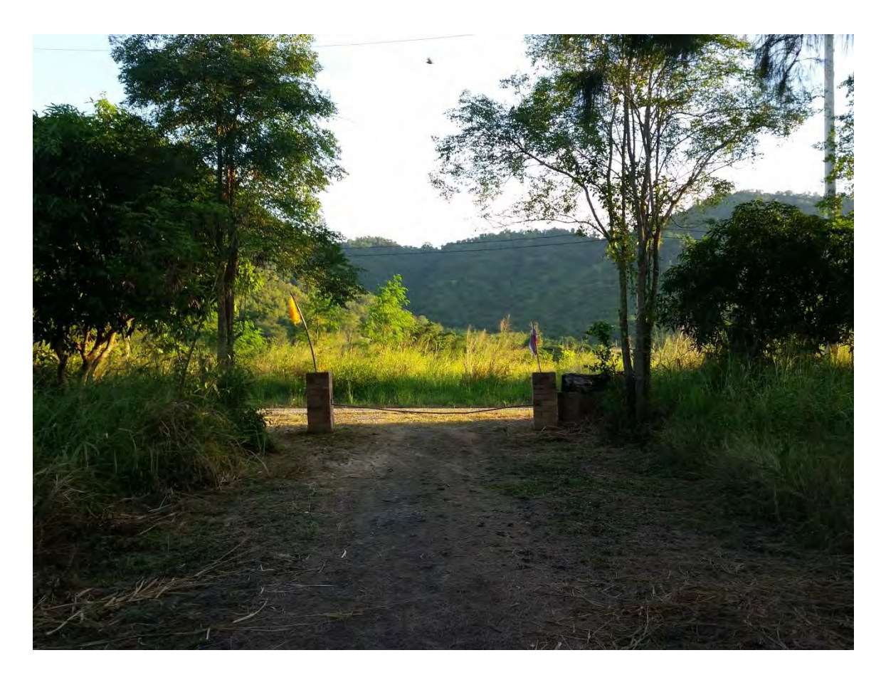
Gate Condition - Good

Recommendation – Redesign / Rebuild / Add Metal Gate / Add {Wiring / Fixtures}