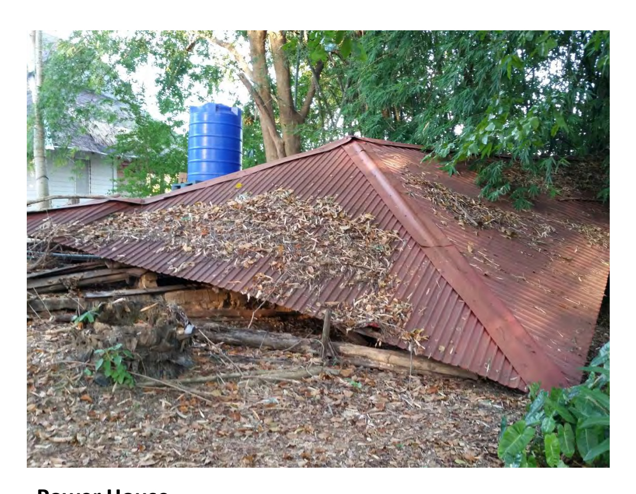
Power House Condition - Collapsed Recommendations — Demolition / Rebuild / New Generator Salvage - Roof