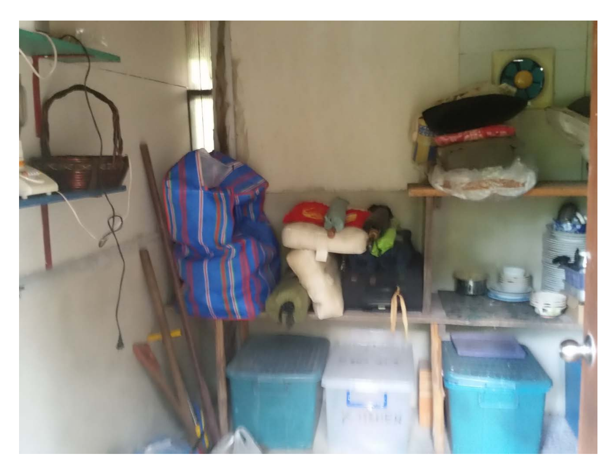
Storage Condition – {Roof / Walls / Floor / Electric} Ok Recommendation – Replace {Wiring / Fixtures}