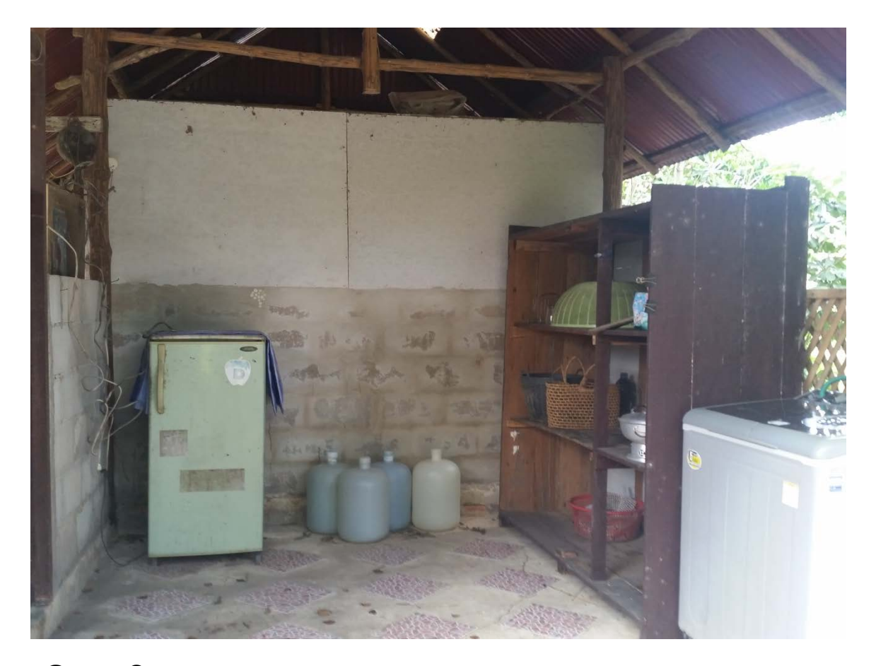
Open Storage Condition – {Roof / Walls / Floor / Some Electric} Ok

Recommendation – Replace {Wiring / Fixtures} / New Shelves