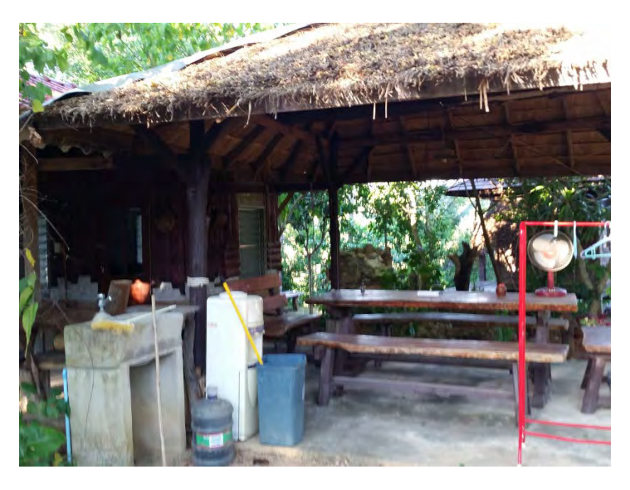
HQ Condition - {Walls / Roof / Floor / Electric} Ok

Recommendation – Replace {Thatch / Wiring / Fixtures / Tap / Plumbing} / Insect Control Unknown – Sink Function