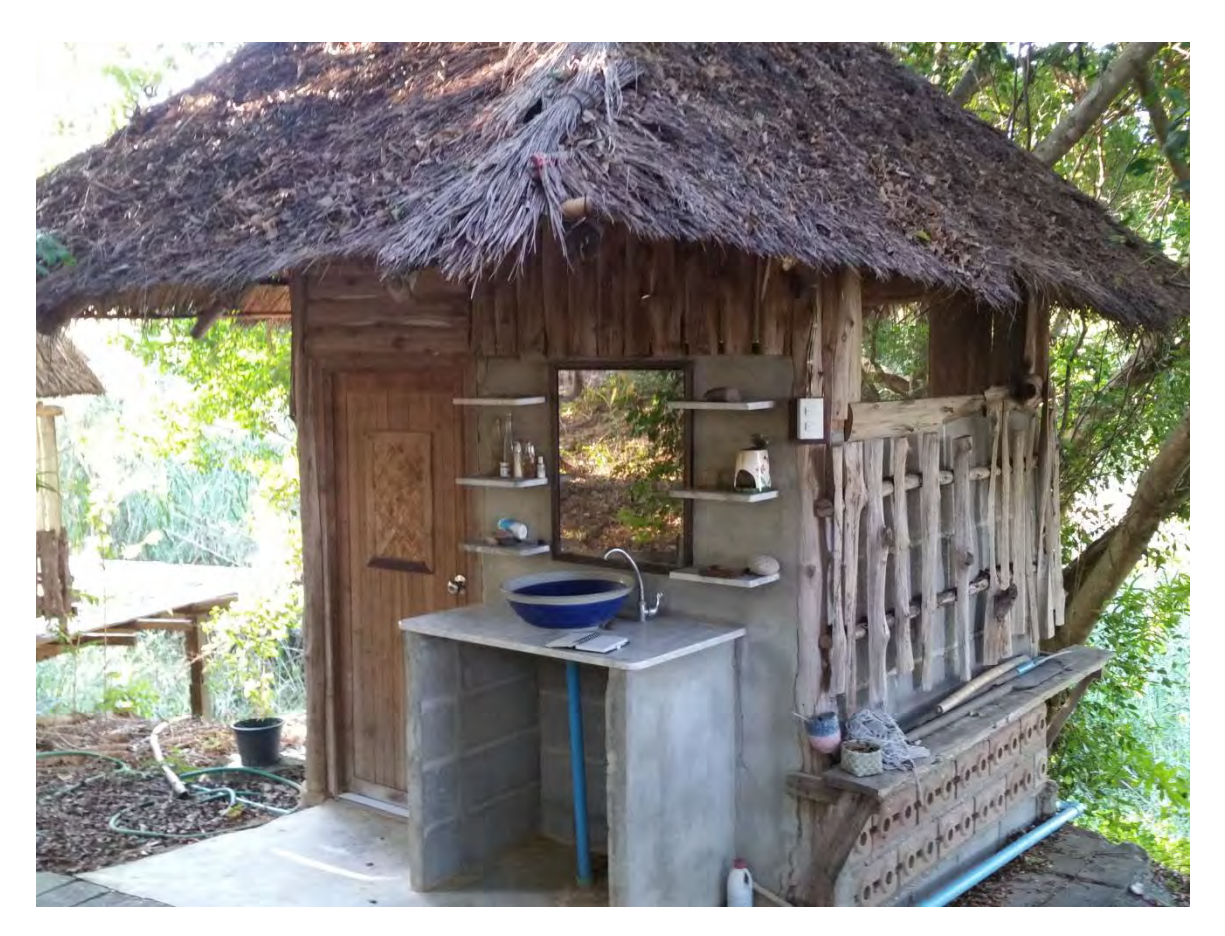
Shower House Condition - Good

Recommendation – Replace {Thatch / Screens} / Insect Control