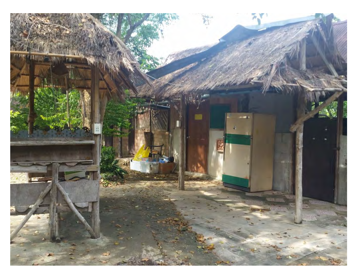
Buffet Kitchen Condition – Limited Use

Recommendation – Replace {Roof / Wiring / Fixtures}