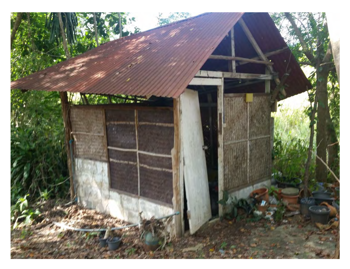
Building #1 Condition – Collapsed roof / Structurally Unsound / Full of Trash / 3 Broken Toilets outside

Recommendation- Demolition Salvage - Roof