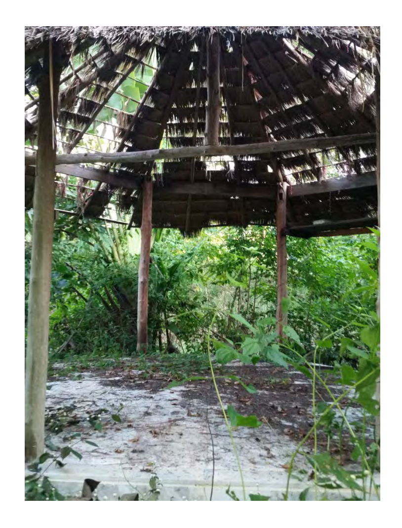
Isla Condition – No Roof / Floor Ok Recommendation – New Thatch / Replace {Wiring / Fixtures}