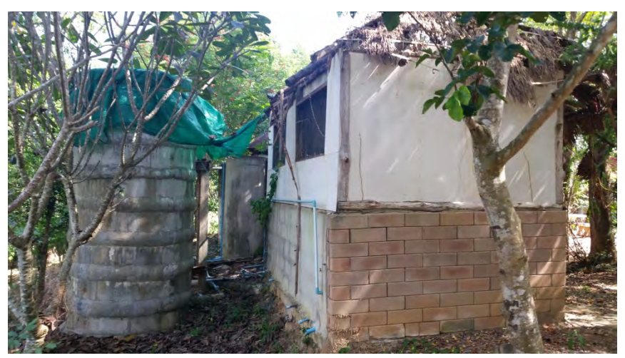
West Bathhouse Pair Condition – No Roof / Unusable / Unsanitary

Recommendation – Replace {Wiring / Fixtures} Unknown – {Toilet s / Sinks/ Tubs} Function