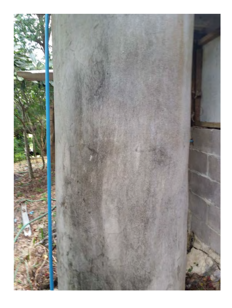
Small Water Tank Condition – No Top / Foul Odor

Recommendation - Replace or {Sanitize / Add Secure Lid / Replace Plumbing / Add Particle Filter / Add UV Filter}