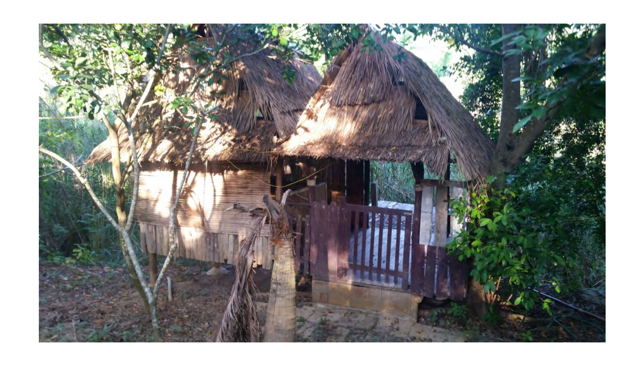
Aree Condition - Good

Recommendation – Replace Thatch / Asses Porch Structure / Replace {Wiring / Fixtures} / Insect Control