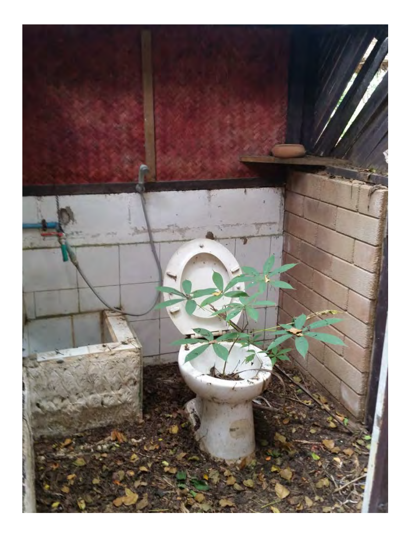
North West bathroom Pair Condition – Unusable / Unsanitary / Foundation OK / No Roof

Recommendation – Rebuild Above Foundation / Replace {Plumbing / Roof} Unknown – {Toilet / Tub} Function Salvage - Toilets