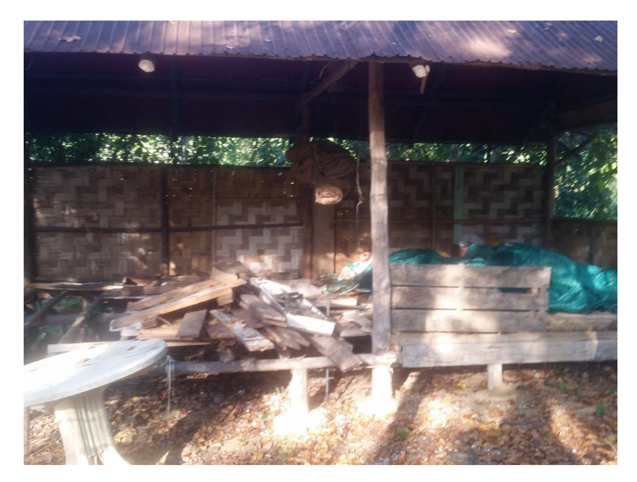
Building #2 Condition – Unsafe / Full of Trash / Unusable

Recommendation – Demolition Salvage – Roof