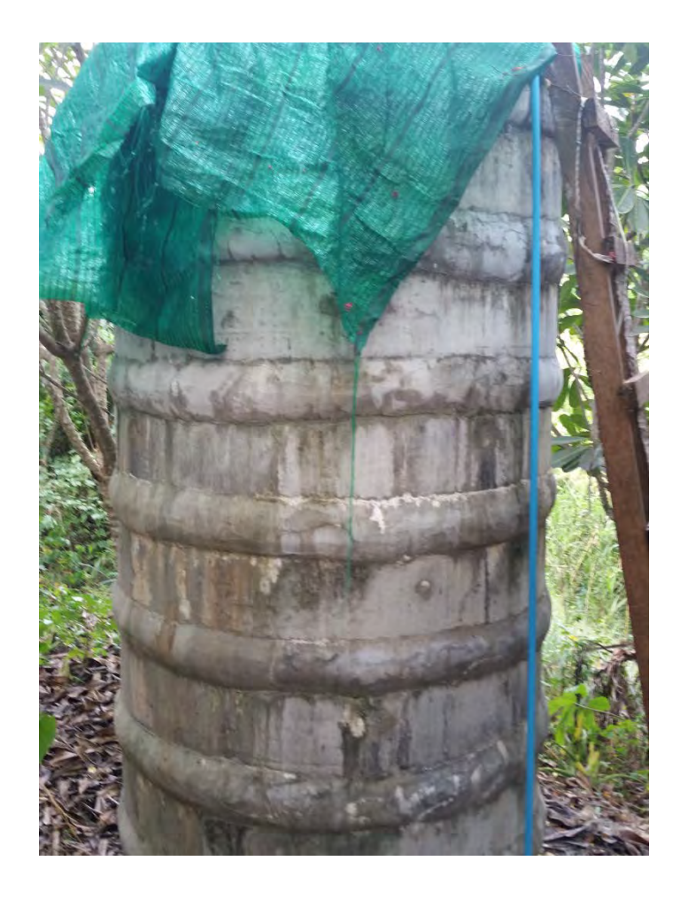
Large Water Tank Condition – Cracked / Leaking

Recommendation – Replace or {Sanitize / Add Secure Lid / Replace Plumbing / Add Particle Filter / Add UV Filter}