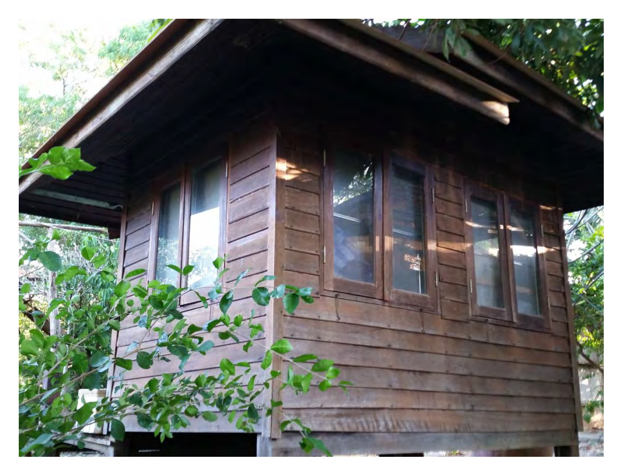
Pico Condition - Good

Recommendation – Replace {Wiring / Fixtures} / Furnishings / Insect Control / Bed / Mattress